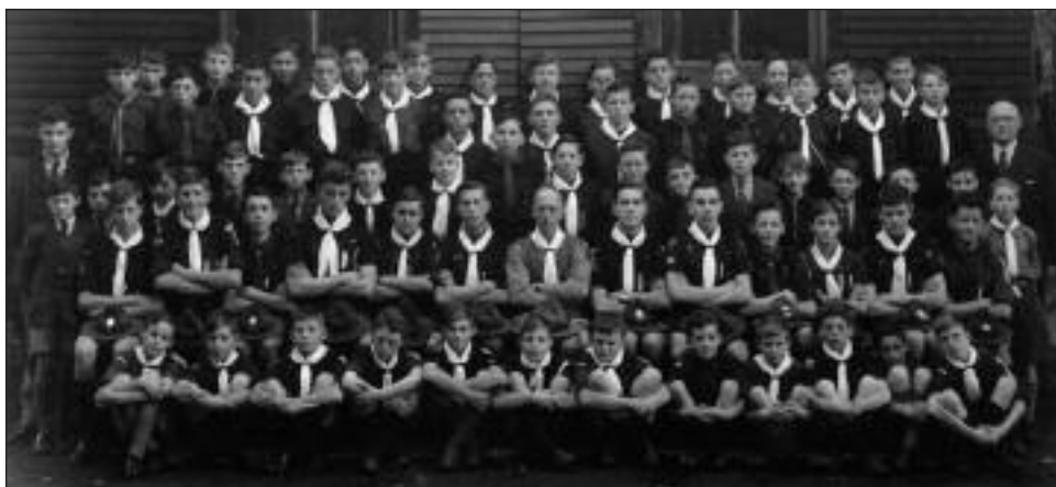
Tiffin Scouts 1942/43